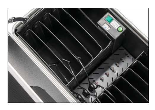
- Chrage (Switch On/Off)