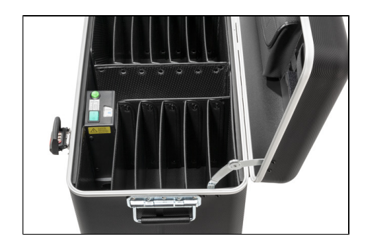
- 12 x storage compartment for laptops